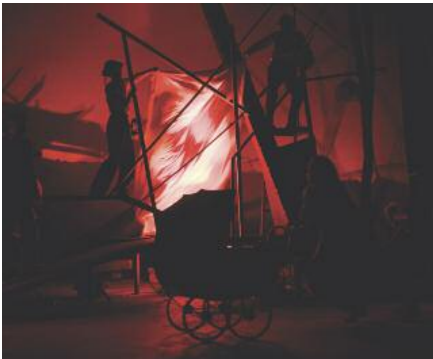
London on Fire

appropriate and visible. We also thought it was likely that we could be quite open about where the props were placed and not necessarily try to hide them before or after they were used.