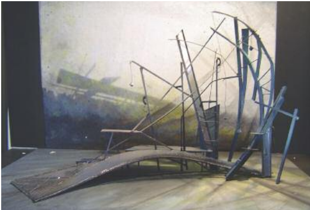
The Final Set Model