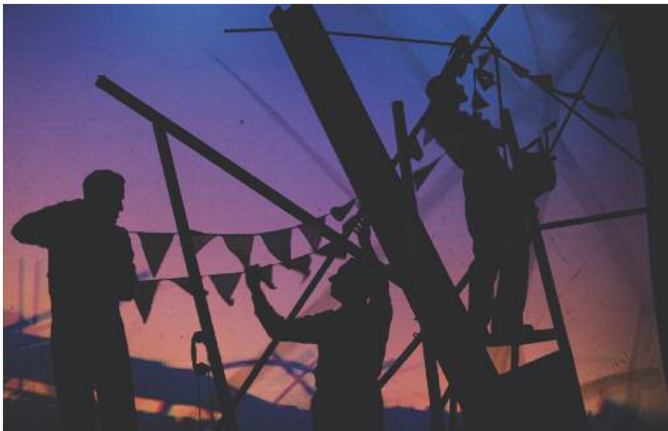
Putting up the bunting