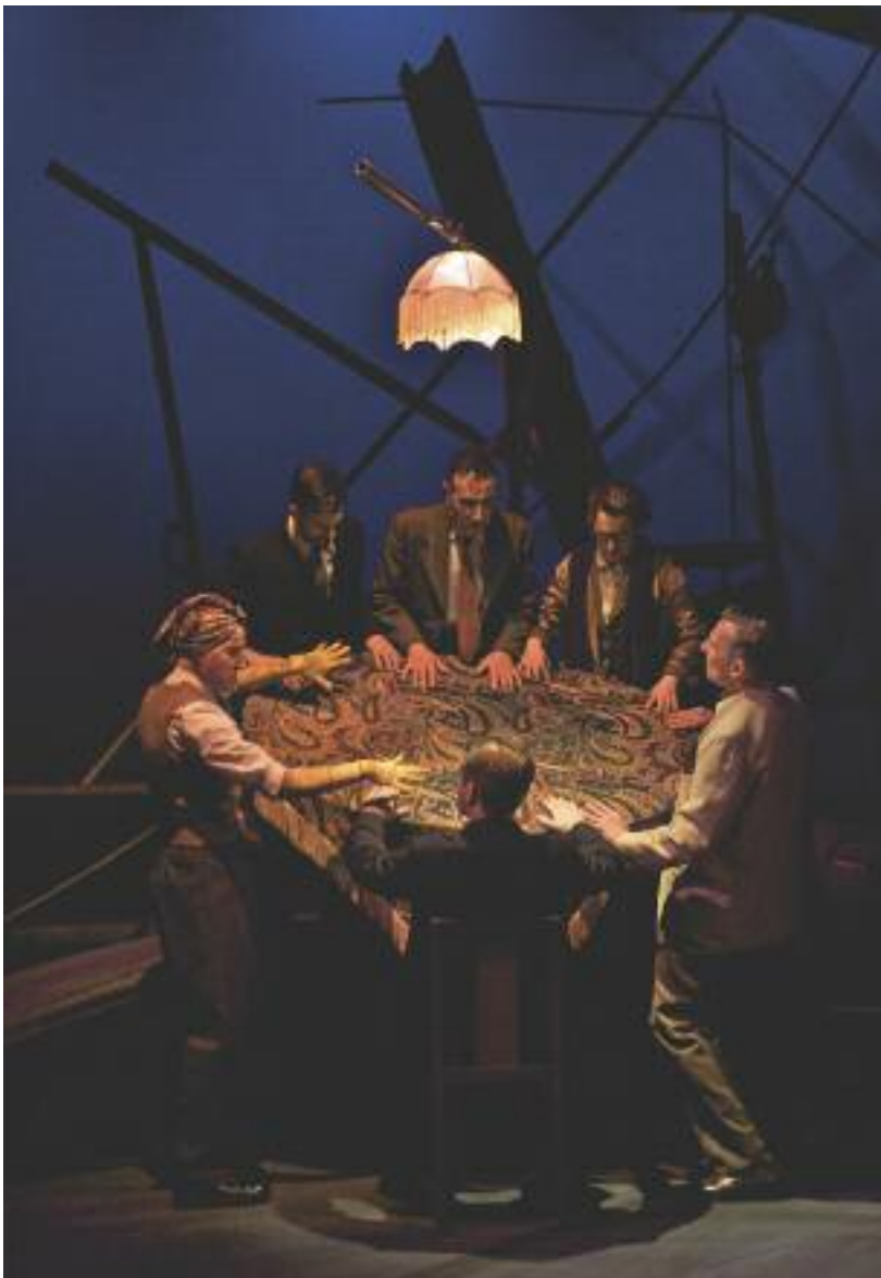
The whole cast

In the R&D we hit on an idea that solved both the issue of sightlines and of getting a table on stage. Why not tilt the table to give the audience the sense that they are looking down on it from above? The characters behind the table would need to be raised up on the set so that they could be seen over the top edge of the table. The actor downstage would have to crouch or even lie on the ground so we could see over his head. Everyone could hold hands and be seen by the audience. And if the table needed to tilt, surely the legs would be a hindrance. Why not just use a table top? This could be brought on and off stage and manipulated by the actors more easily. They would need to hold the table between them though, using elbows, knees and waists. Actually, in practice, this turned out to be perfectly possible.